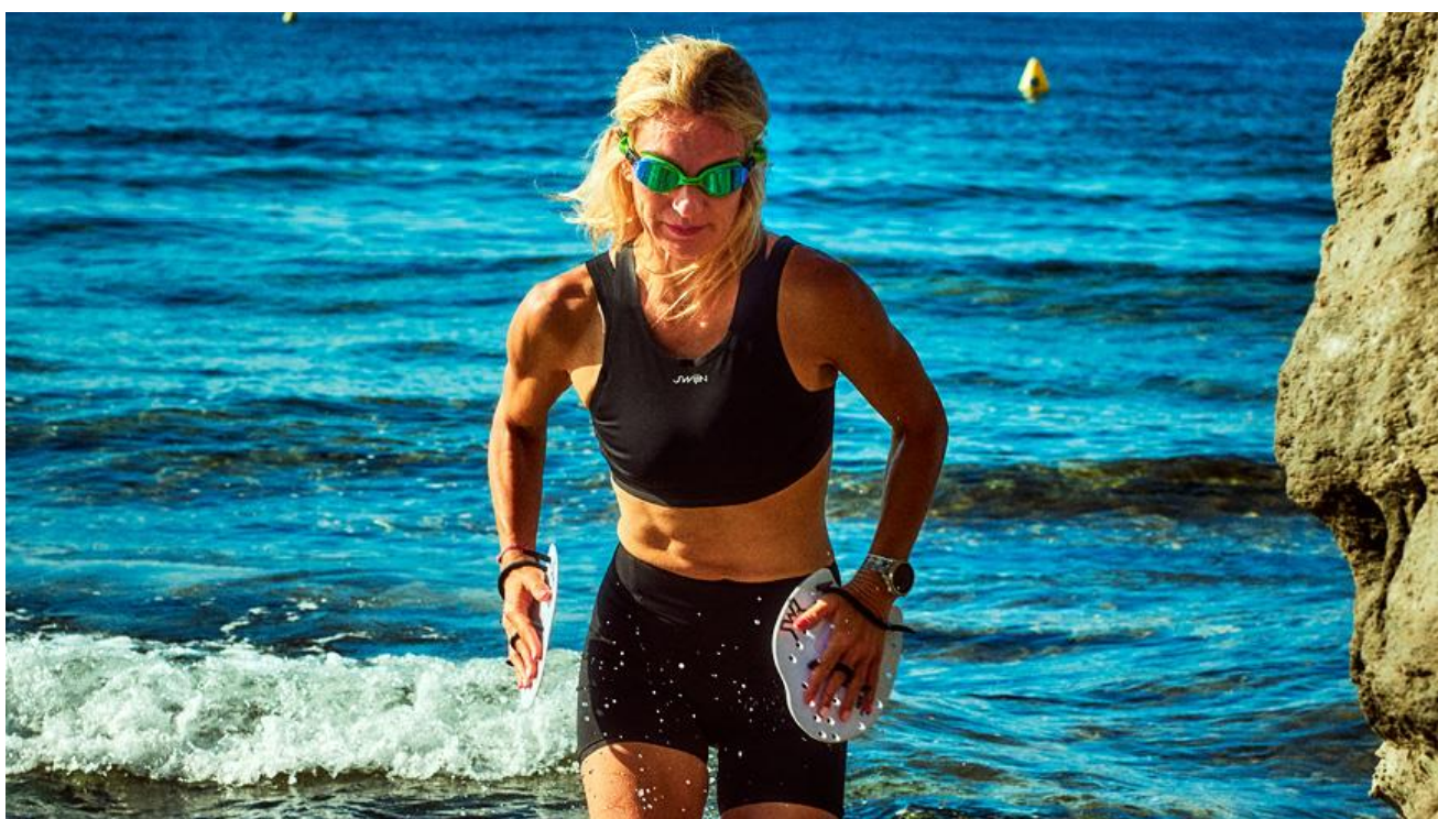
During swimrun races, athletes switch back and forth between swimming and trail running, which puts high demands on their sportswear.

Just in time for summer: The Swiss start-up Swijin is launching a new sportswear category with its SwimRunner – a sports bra together with matching bottoms that works as both swimwear and running gear and dries in no time. The innovative product was developed together with Empa researchers in an Innosuisse project. The SwimRunner can be tested this weekend at the Zurich City Triathlon.