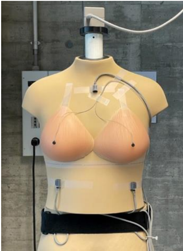
The "Nici" mannequin was developed to investigate the mechanical properties of bras.